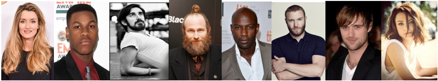
Natascha McElhone John Boyega Ferdi Kingsley Paul Kaye David Gyasi Diarmaid Murtagh Jonas Armstrong Kathryn Prescott